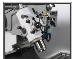
SPINDLE HEAD BS