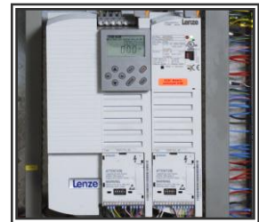
SPINDLE CONTROL UNIT